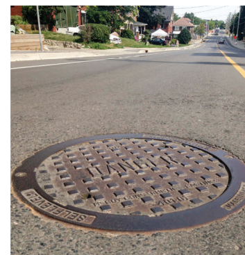
SELFLEVEL assembly floats with the roadway, keeping the surface smooth during settling and frost heave.

Improve driveability while reducing road maintenance, inflow, and infiltration. Available for asphalt and concrete applications.